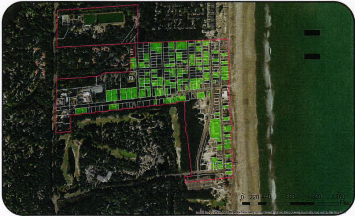
FIGURE 1: LOCATION MAP (AMERICAN BEACH)